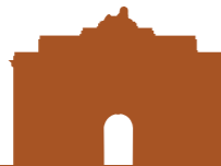
Ypres 30 min