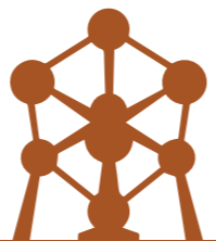
Brussels 90 min